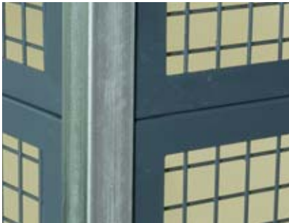
Saf-T-Fence's tough steel frames and tight mesh of welded wire provide extra security and durability.