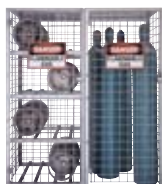
Variety of Saf-T-Stor models provide horizontal, vertical or a combination of storage configurations. Saf-T-Stor™ Combo shown.

Easy Assembly - Components are slotted for easy assembly with common hand tools.