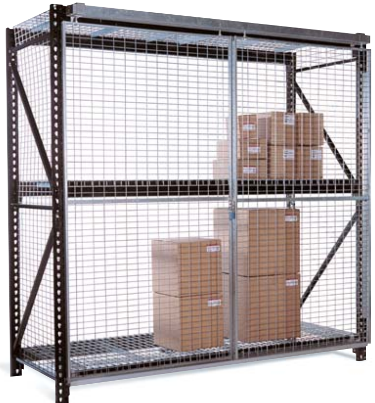
Loss Prevention Pallet Rack System (far right) and Security Cabinets securely store material while providing quick visual inspection.

Easy Assembly - Pre-punched rack components are easily assembled.