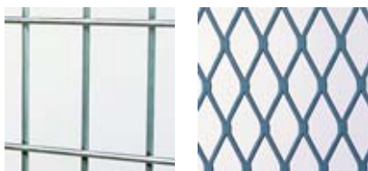
Bulk Storage Lockers are available in two durable grades: welded wire (left); and expanded metal (right).

High Quality Material - Choose from two heavy duty grades: Industrial or Commercial welded wire and expanded metal in either galvanized or grey enamel finish. Colors available.