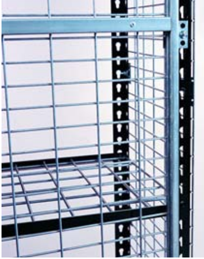
Loss Prevention Shelving components attach easily and securely to existing shelving.